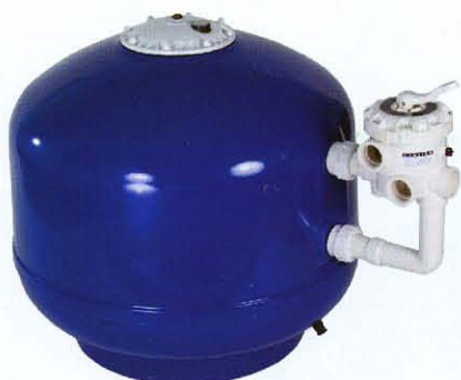
Filter Ø950 with 2" valve