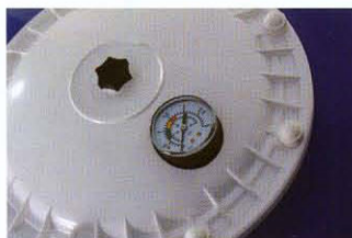
300 mm Top Lid with easy to read pressure gauge