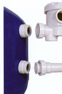
Side mount Valve 2"